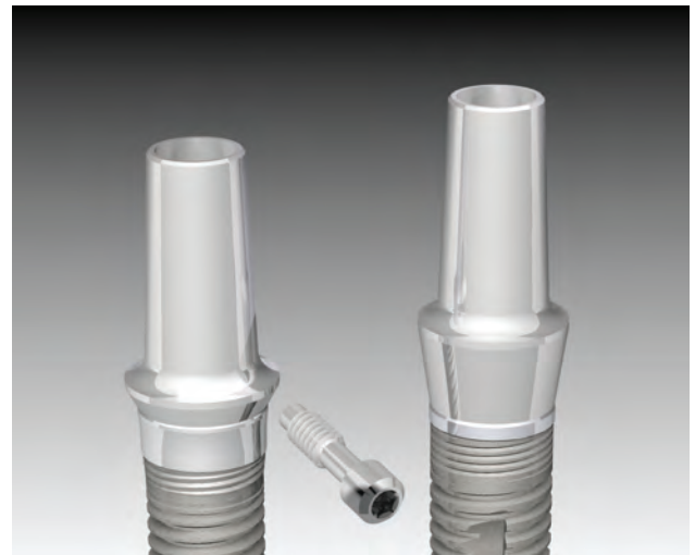
IAA01 on Long Collar Implant